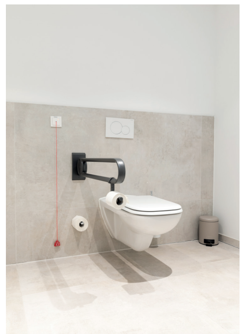
General accessible WC