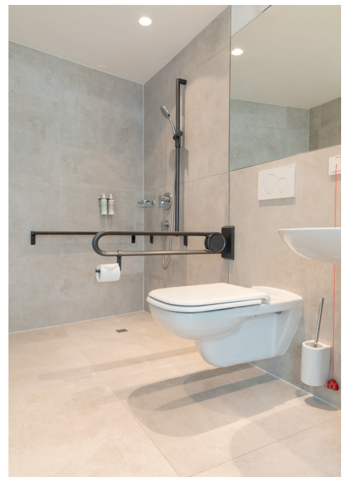
Bathroom and WC