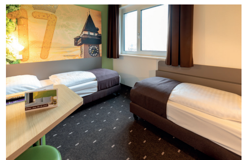
Room no. 102