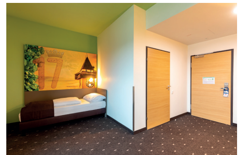
Room no. 101