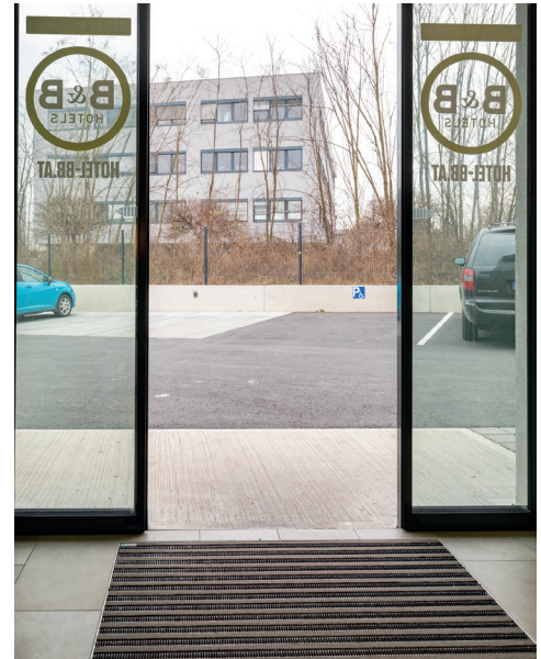
Parking and access to the hotel