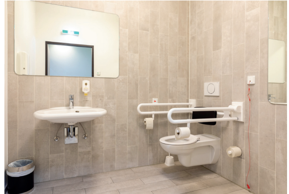
General accessible WC