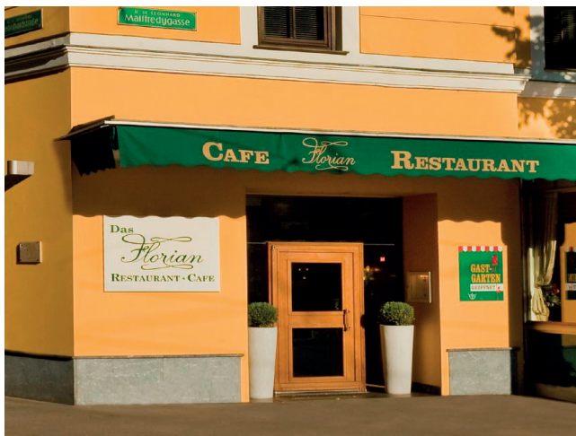
Entrance to the restaurant