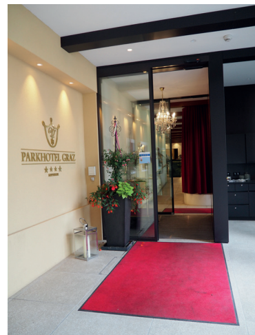
Access from the parking