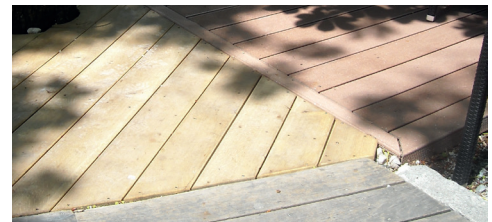
Connection between beer garden and terrace