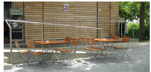
Beer garden ramp, tables