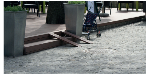
Mobile ramp on terrace

Validity: April 2012, errors and omissions excepted, Graz Tourism in cooperation with Hartberg Disability Support Group