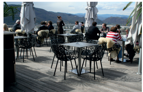
Terrace of bar on upper floor