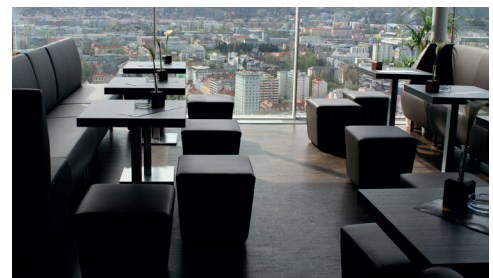
Interior of bar on upper floor