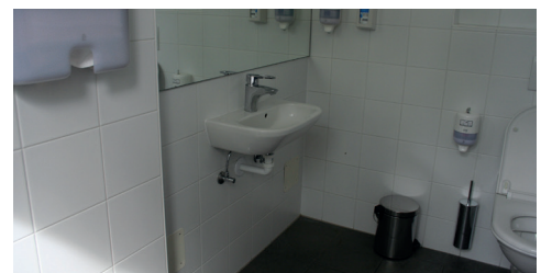
Beer garden washbasin, WC