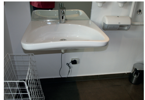
Washbasin in restaurant