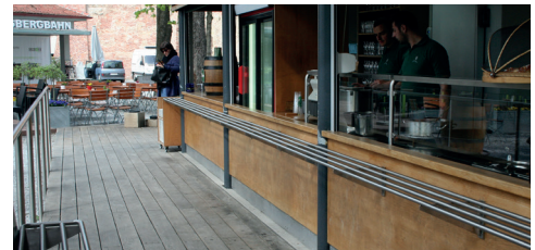
Beer garden self-service area