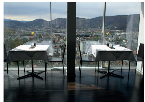
Tables in restaurant