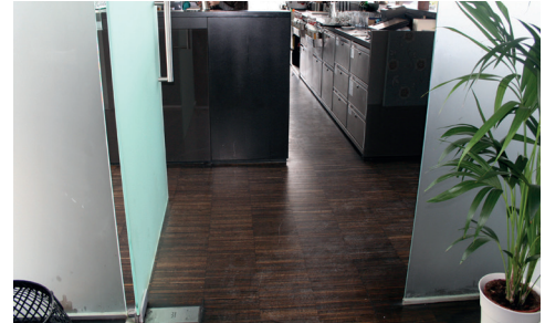
Entrance to bar on upper floor