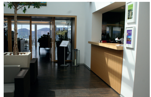
Entrance to restaurant