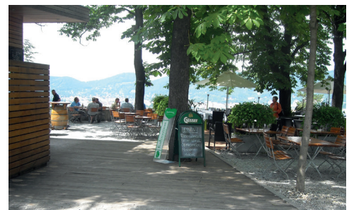
Access to beer garden and terrace