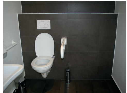
WC in restaurant