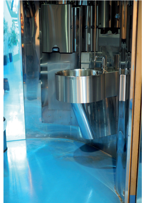
Washbasin in the WC